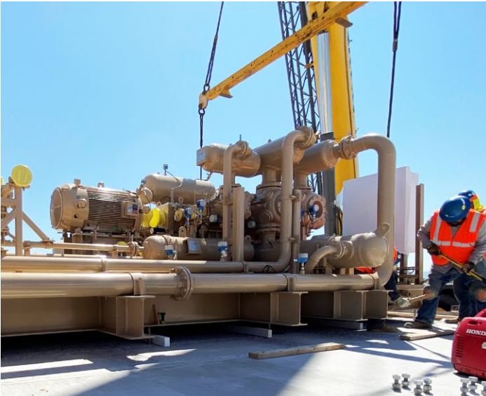
Field Service Base Installation